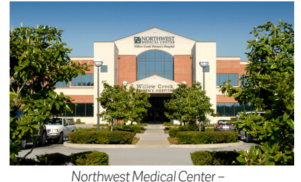
Willow Creek Women's Hospital, Johnson

Helping people get well and live healthier is rewarding work. We are grateful for the trust every patient places in us.