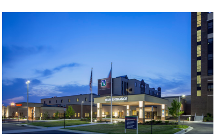
Northwest Medical Center – Springdale